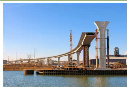
Cline Avenue Bridge

Since Cline Avenue Bridge construction began in June of 2017, the foundations and support columns have been constructed, existing steel bridge preservation work is complete, all the segments have been fabricated, and superstructure erection has sur-