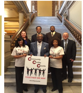
Introduction of #Civility Counts Resolution at State House in Indy.